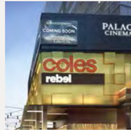
RAINE SQUARE, PERTH, WA