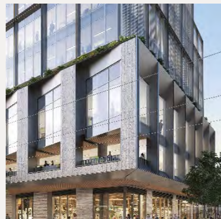
480 SWAN ST, RICHMOND, VIC