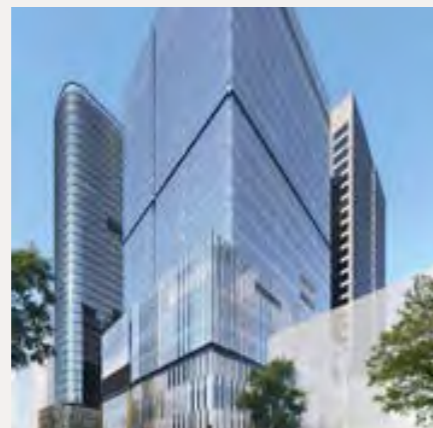
140 LONSDALE ST, MELBOURNE, VIC