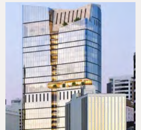
360 QUEEN ST, BRISBANE, QLD