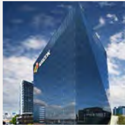
900 ANN ST, BRISBANE, QLD