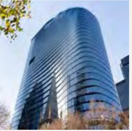
130 LONSDALE ST, MELBOURNE, VIC