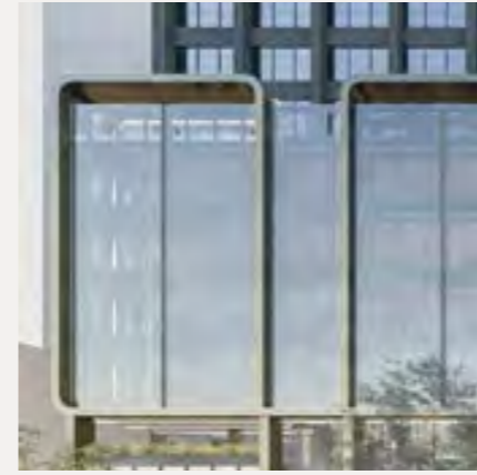
150 LONSDALE ST, MELBOURNE, VIC