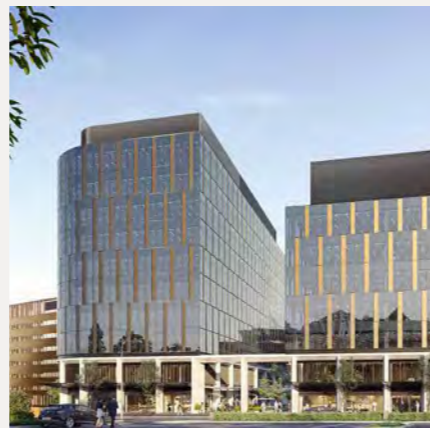
IQ WESTMEAD, NSW