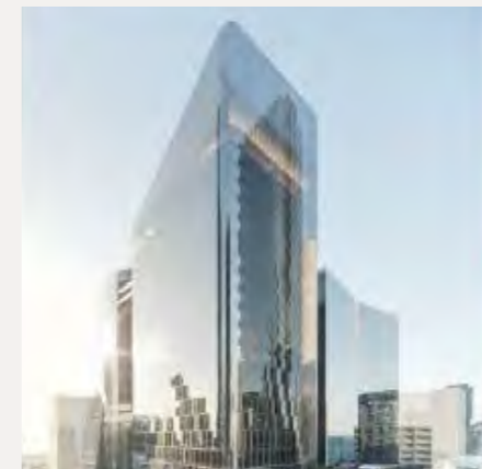
555 COLLINS STREET, MELBOURNE, VIC