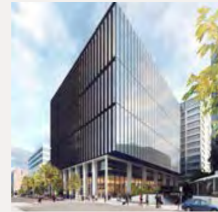
105 PHILLIP ST, PARRAMATTA, NSW