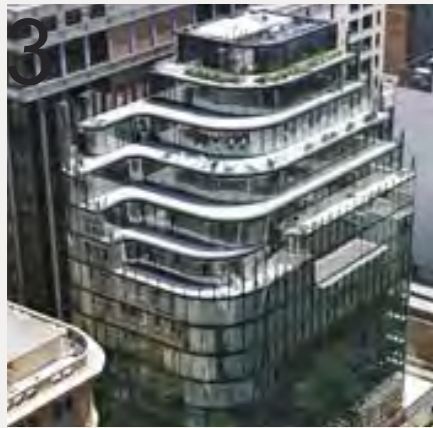
333 GEORGE STREET, SYDNEY